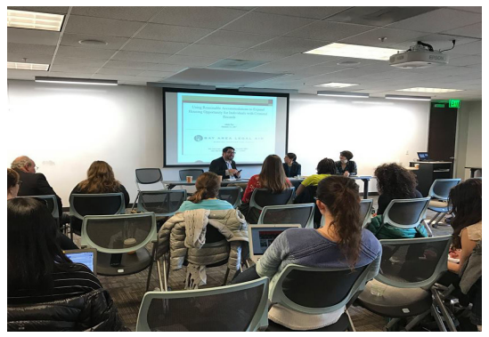
Adam Poe from Bay Area Legal Aid leads a training at Civil Rights for People and Families Impacted by Incarceration, January, 2017.

LAAC continues to offer extensive free and low-cost trainings for the California legal services community. This year's offerings included: